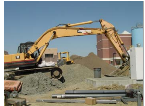
Construction workers building extra odor control at the District.

Another project, still in the design phase, is to eliminate surface flooding that occurs on Donner Pass Road, making life a little easier for area residents.