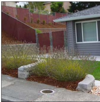
Sidewalk shows District cleanout cover, before and after replacement.